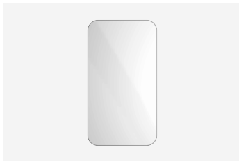
Wall Mounted Mirror/Rectangular TSL.MR20