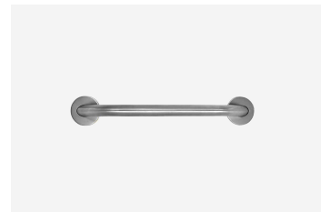
Straight Grab Bar - 450mm TSL.GR45.450