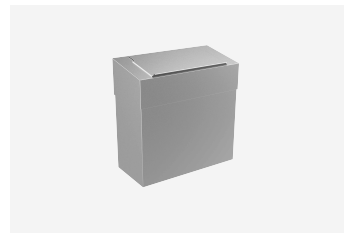
Wall Mounted Waste Bin TSL.910