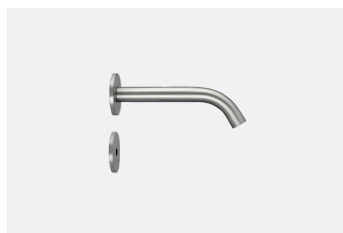
150mm IR Sensor Tap TSL.884