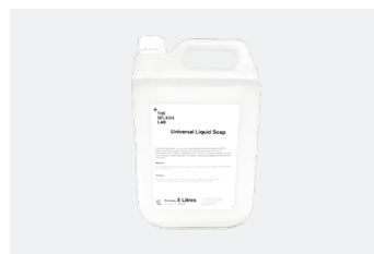
Universal Liquid Soap TSL.ULS