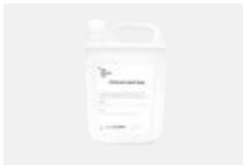
Universal Liquid Soap TSL.ULS