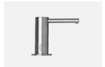
Sensor Deck Mounted Soap Dispenser TSL.420