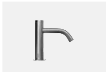
Sensor Deck Mounted Tap/Small TSL.990