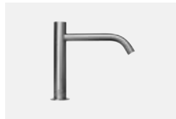
Sensor Deck Mounted Tap/Large TSL.960