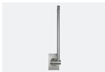
Hinged Grab Bar TSL.GR45