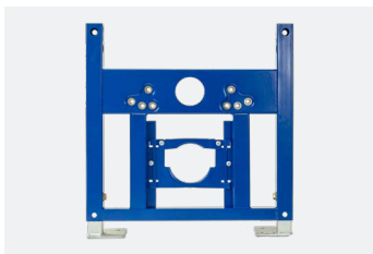
WC Frame TSL.WCFRAME