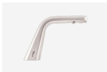
The Ribbon Soap Dispenser TSL.R011