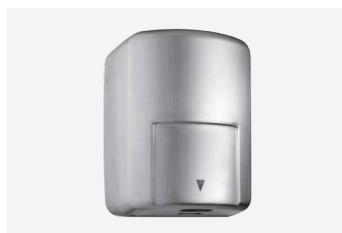
Air Fury Hand Dryer TSL.89