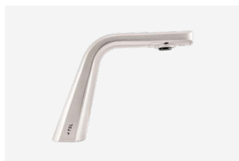
The Ribbon Sensor Tap 2.0 TSL.R021