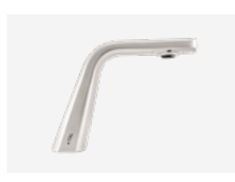
The Ribbon Sensor Tap 2.0 TSL.RO21