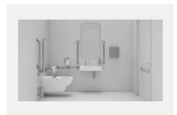
DDA Doc M Pack Wall Hung WC/ Hand Dryer TSL.DDA.R1