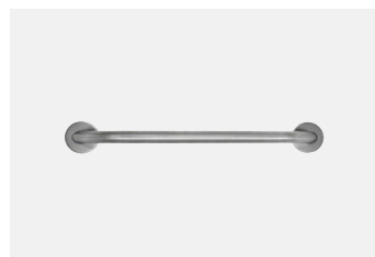
Grab Bar - 600mm TSL.45.600