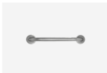
Grab bar TSL.45.600