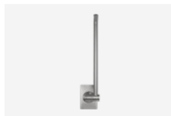
Hinged grab bar TSL.GR45