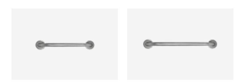
Grab bar TSL.45.450