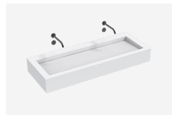
Monolith M Series - 450mm TSL.M