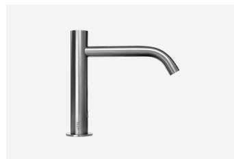
Sensor Deck Mounted Tap/Large TSL.960