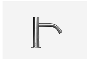
Sensor Deck Mounted Tap/Small TSL.990