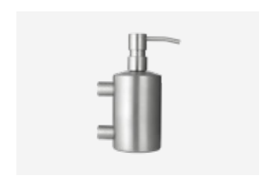
Wall Mounted Cylindrical Pump Soap Dispenser TSL.938