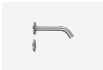
150mm IR Sensor Tap TSL.884