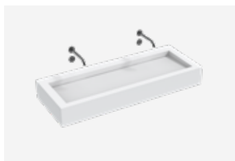
The Monolith M Series TSL.M