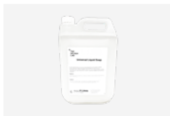
Universal Liquid Soap TSL.ULS