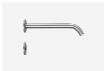
IR Sensor Tap TSL.882