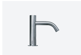
Sensor Deck Mounted Tap / Small TSL.990