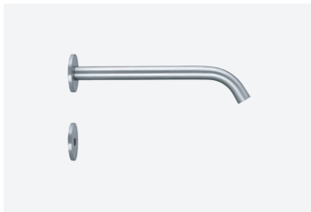
IR Sensor Tap TSL.882