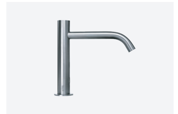
Sensor Deck Mounted Tap / Large TSL.960