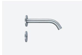
150mm IR Sensor Tap TSL.884