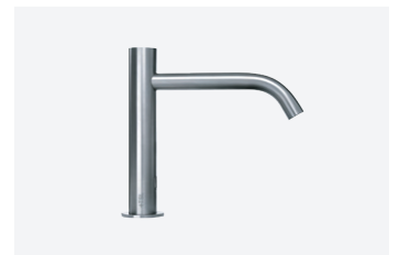
Sensor Deck Mounted Tap / Large TSL.960